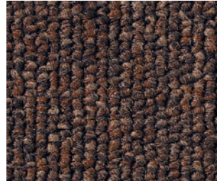
_145 biber O/□