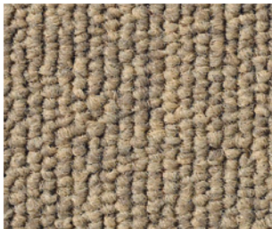
_181 sand O/□ > 200 m 2