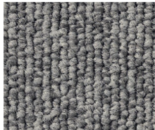
_111 alu O/□