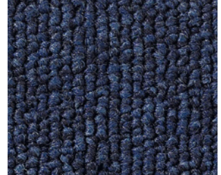
_129 indigo O/□ > 200 m 2