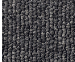
_118 elefant O/□