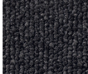
_119 marengo O/□