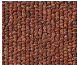
_162 terracotta O/□