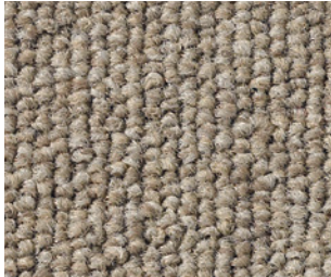
_143 bast O/□ > 200 m 2