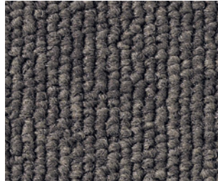
_110 maus O/□ > 200 m 2