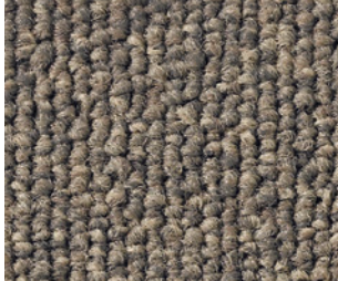
_186 grège O/□ > 200 m 2