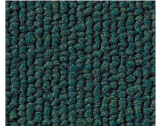
_133 grün O/□