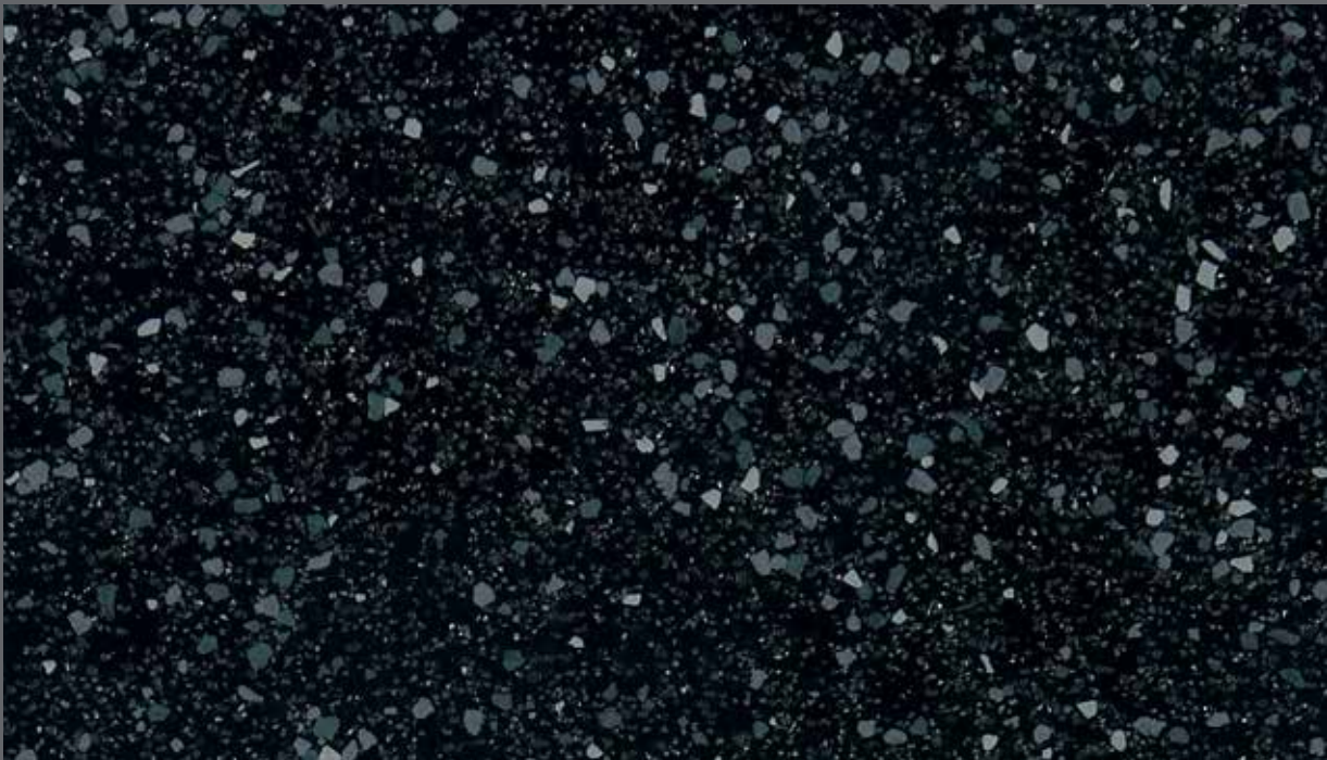
Ebony | IP2001 WR100 / A1M100 / LRV 6