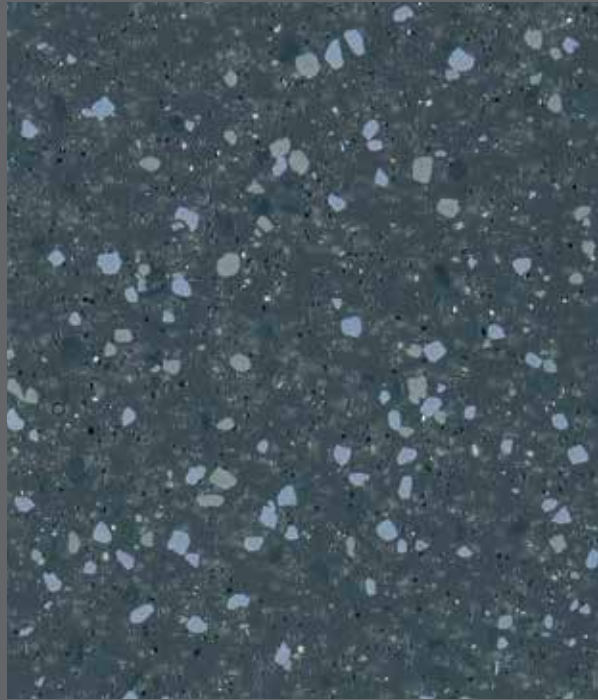
Mineral | IP2003 WR83 / A1M83 / LRV 14